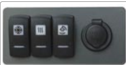
■ STV 714 Order-No.: 0 2000 7140

Watertight panel with 3 circuit breakers 10 A and cigarette socket 21 mm, incl. gasket. Actuators have to be ordered separately. Please see page 25.