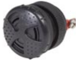
SUM 29 Order-No.: 7 0010 1070

Watertight buzzer for 12 V / 24 V, IP68. Rotating bezel adjusts alarm volume in a wide range.