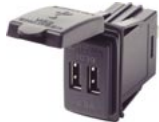
USD EK Order-No.: 7 0010 1039

USB double charging socket 12 V / 24 V front rubber cap as splash protection.