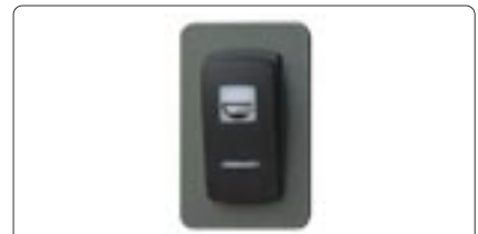
■ STV 711 Order-No.: 0 2000 7110

Watertight panel with 1 thermal circuit breaker 10 A, incl. gasket. Actuator has to be ordered separately. Please see page 25.