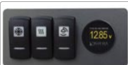
■ STV 714V Order-No.: 0 2000 7145

Watertight panel with 3 circuit breakers 10 A and voltmeter MVD incl. gasket. Actuators have to be ordered separately. Please see page 25.