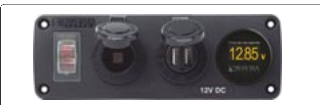
■ BS 4366 Order-No.: 7 0010 4366

Dimensions: side module: W 35 x H 68 mm, middle module: W 26,2 x H 68 mm