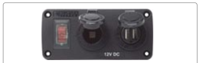
■ BS 4363 Order-No.: 7 0010 4363

Outdoor socket panel made of UV-resistant polycarbonate with a 15 A circuit breaker, DC and USB double charging socket including seal.