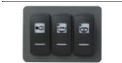
■ STV 713 Order-No.: 0 2000 7130

Watertight panel with 3 thermal circuit breakers 10 A, incl. gasket. Actuators have to be ordered separately. Please see page 25.