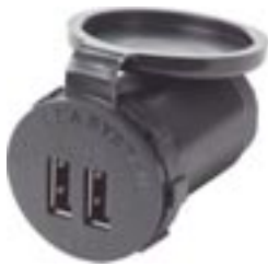
BS 1045 Order-No.: 7 0010 1045

USB double charging socket 12 V / 24 V front rubber cap as splash protection.