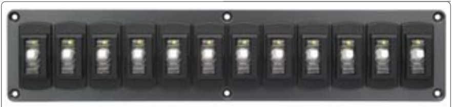
■ STV 722 Order-No.: 0 2000 7220

Watertight panel with 12 circuit breakers 10 A. Mounting via screws from the front. Actuators have to be ordered separately. Please see page 25.