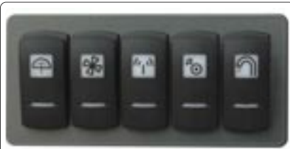
■ STV 715 Order-No.: 0 2000 7150

Watertight panel with 5 thermal circuit breakers 10 A, incl. gasket. Actuators have to be ordered separately. Please see page 25.