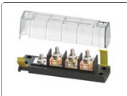
■ BS 5196 Order-No.: 7 0010 5196

The terminal fuse block ABH 1 is designed for an easy and space saving installation of high current bolt fuses directly on a battery or a bus bar. Maximum current of the fuse holder ABH 1 is 300A. Rated voltage 58V.