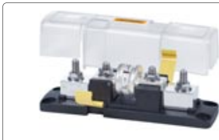
■ BS 5502100 T-Fuse holder Order-No.: 7 0100 5502

The T-fuse is preferably used to protect lithium-ion batteries with a very high short-circuit current.